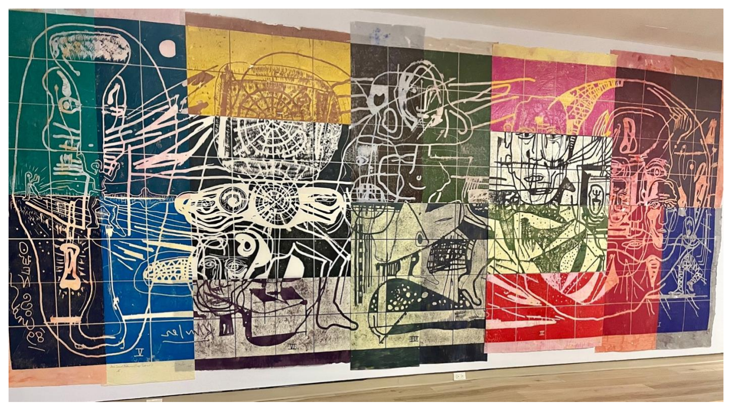
Owen Sound (Self Portrait), 1989 Ink on hand-made Japanese Paper by Harold Klunder

https://www.owensound.ca/recreation-culture/arts-and-culture/tom-thomson-art-gallery/exhibitions/currentexhibitions/the-mark-of-community/