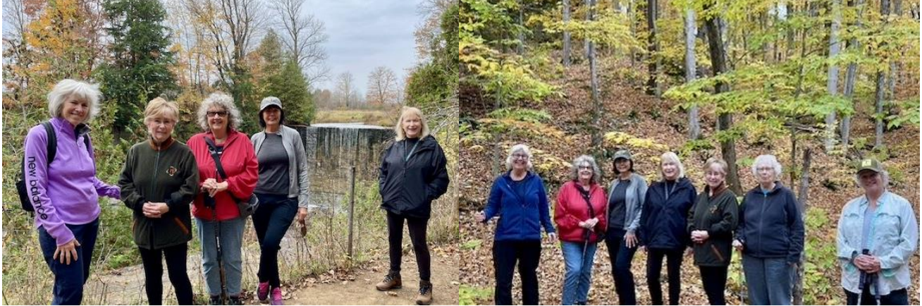
Healthy Lifestyles walkers at Indian River Falls

For the past couple of months our walking/hiking group has been able to revisit some of our favourite trail walks... Shallow Lake, trails off 26th St. West, Superior St., Harrison Park, and Grey Sauble Conservation Area.